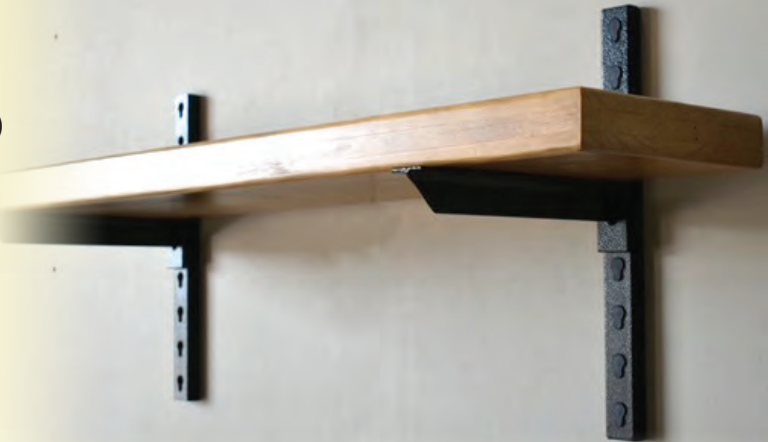
Left vertical arm without finishing plugs